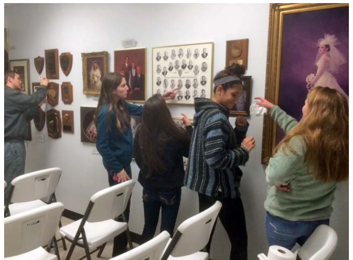
The Dean Collection of photos, paintings, and plaques were shining again.