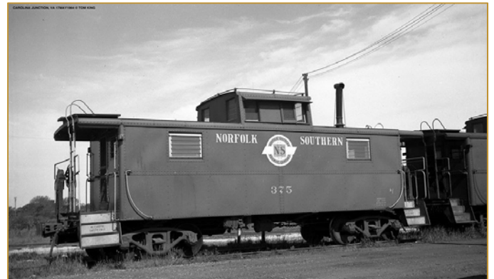
The NS375 as it looked in 1964.

support from railroad interests and individuals. His ideas and knowledge will be valuable to us once we are ready to begin restoration of the caboose.